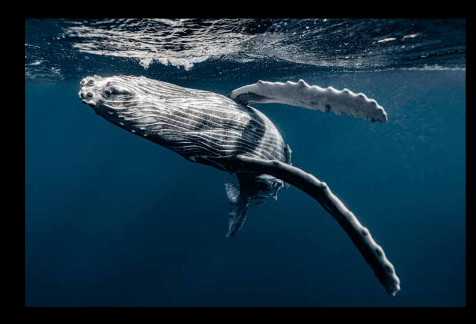
DAY 9 OR 10 OR 12

Ending the day with sunset drinks and dinner either in town or at the resort. (Depending on your booking)