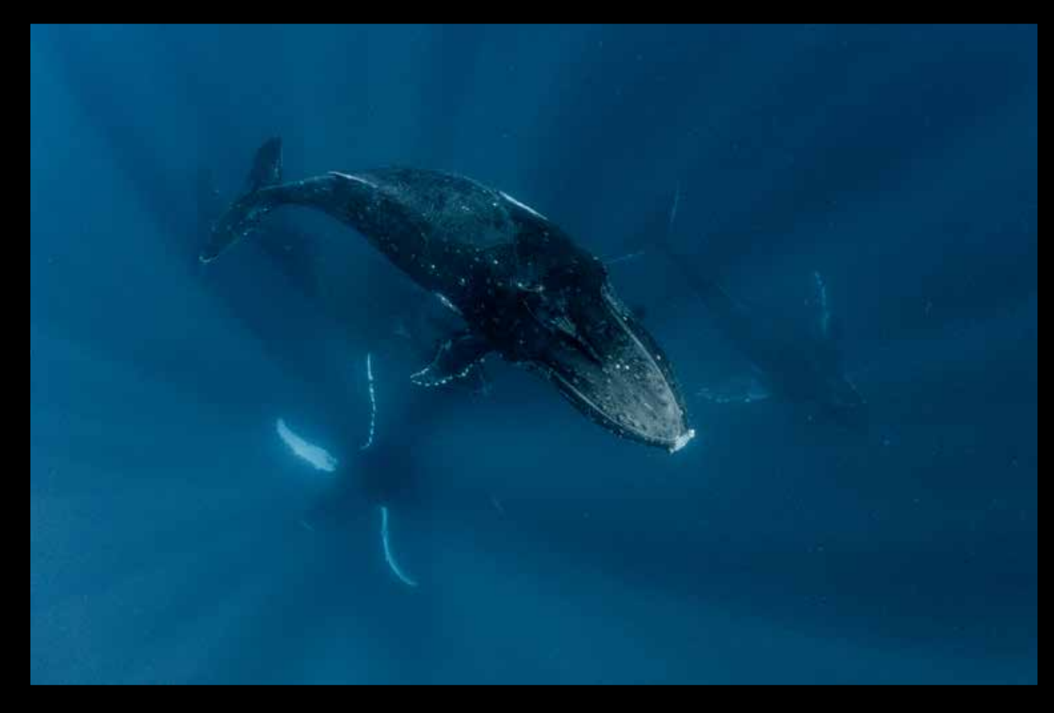
DAY 2-9 / 2-10 / 2-11 / 2-12

Arrival and transfers by taxi to our water front accommodation. Time to settle in at our beautiful place where we can talk about our adventures to come in the following days. There will be a mix of photographers and non-photographers with professional cameras, iphones, GoPros and 360's. Whatever it is, this is the time to set it all up. Rita will be able to give you tips and editing ideas however, this is not a beginners photography course. You have to be able to use your gear and editing programs with confidence. Bring your lap-top or ipad to upload your wonderful photos, so we can all admire our wonderful heart-warming whale encounters.